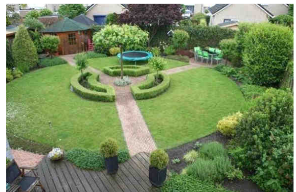
The present garden of our new house

Our new house has a big garden: about 300 m2 to fill with all the inspiration we have from England! This should keep us busy for a while!! Could be a good therapy as well ;-)