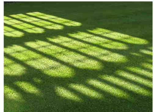
Lawn before Kings College, Cambridge